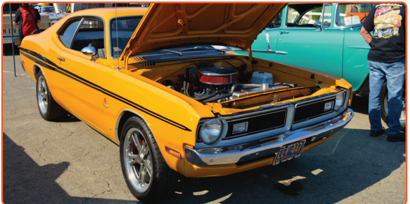
1971 Demon 340 was hard to miss with its bright yellow paint. The neat A-Body sported a wide range of upgrades from engine performance mods to trick custom wheels.