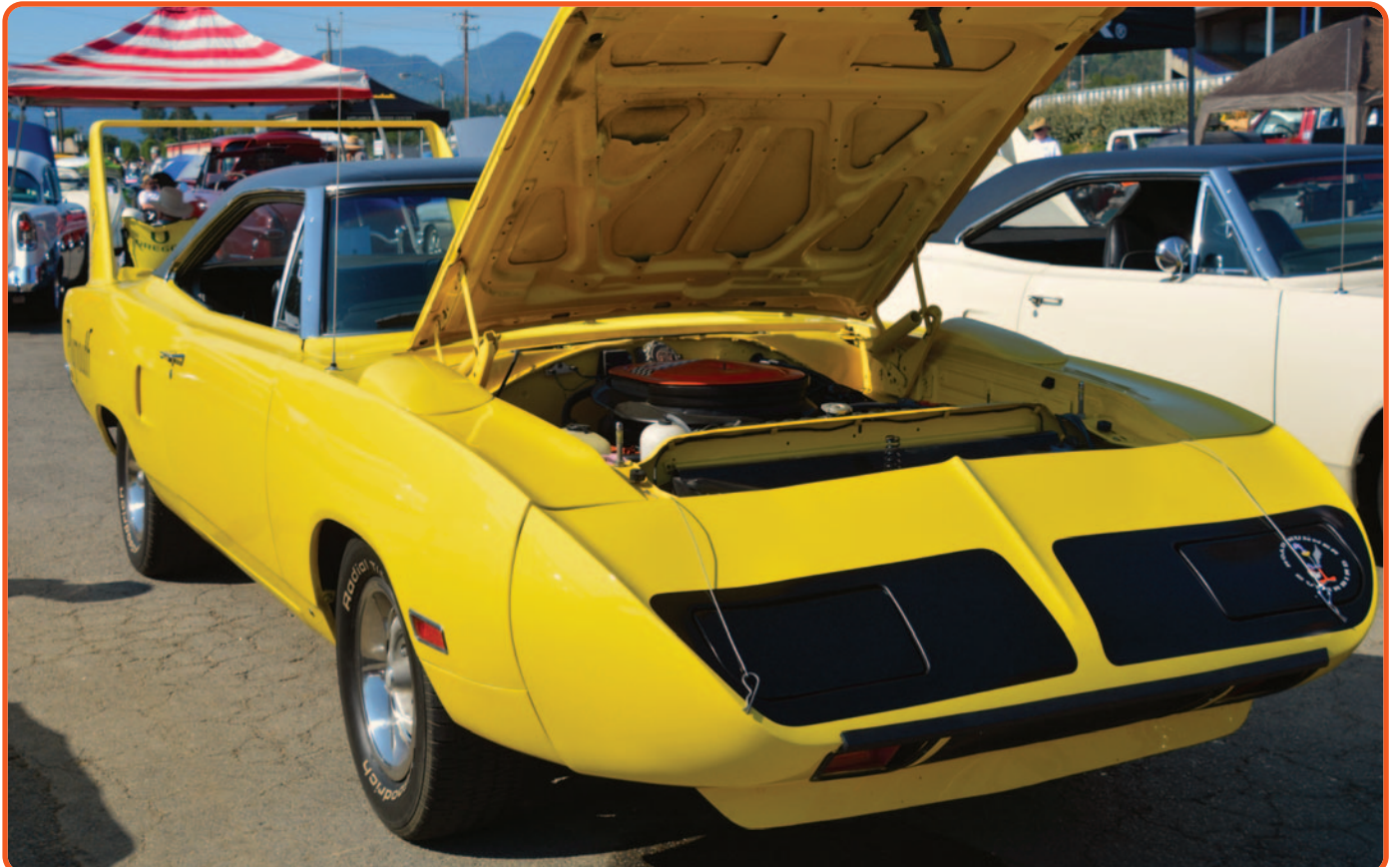
The winged wonder that stops average people in the tracks. What could be more audacious than a bright yellow 1970 Plymouth Superbird? With not just one, but two Superbirds at the show, you can be sure that this one got plenty of attention all day. not just one, but two Superbirds at the show, you can be sure that this one got plenty of attention all day.