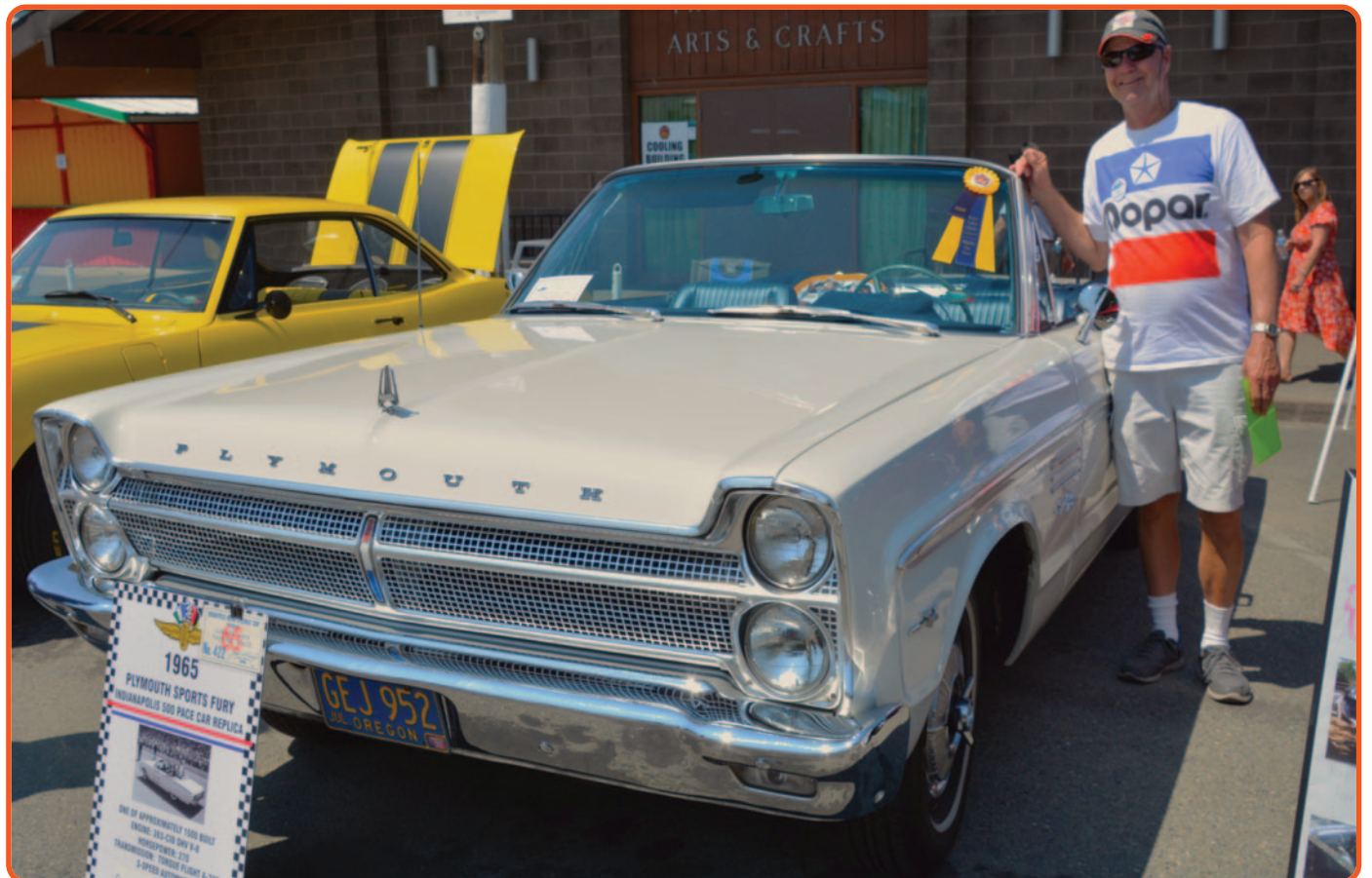
Luxurious C-Bodies like this 1965 Plymouth Fury III convertible were award winners at the show. Driven regularly, after 59 years it still looks factory fresh.