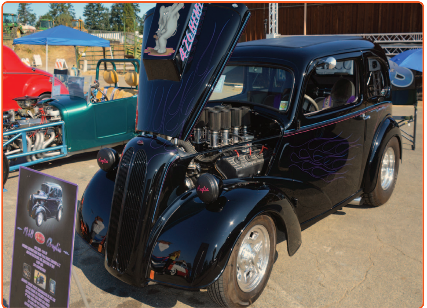
There were several 1960s style gassers on display at this show, including this cherry street driven Anglia. Powered by a Hilborn injected 426 Hemi, it looked ready to run heads up against its arch rival, a wicked Willys.