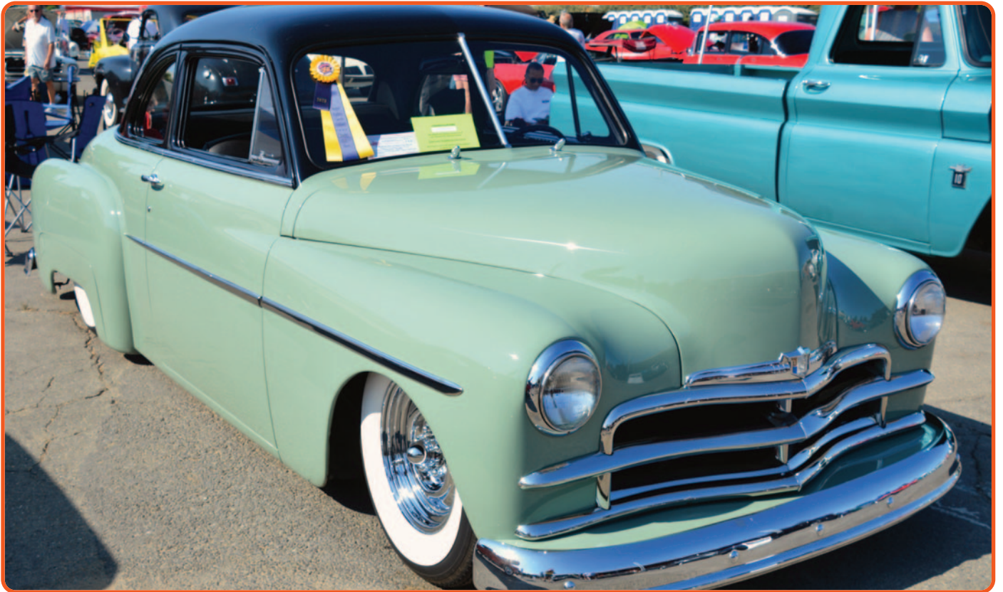
This 1950 Plymouth might be categorized as a mild custom, but the more you look at it, the more you'll find. It was very tastefully done, and loaded with custom mods that were so well integrated that it appeared as though they could have been done in the Plymouth design studio as a refresh for the 1949 model.