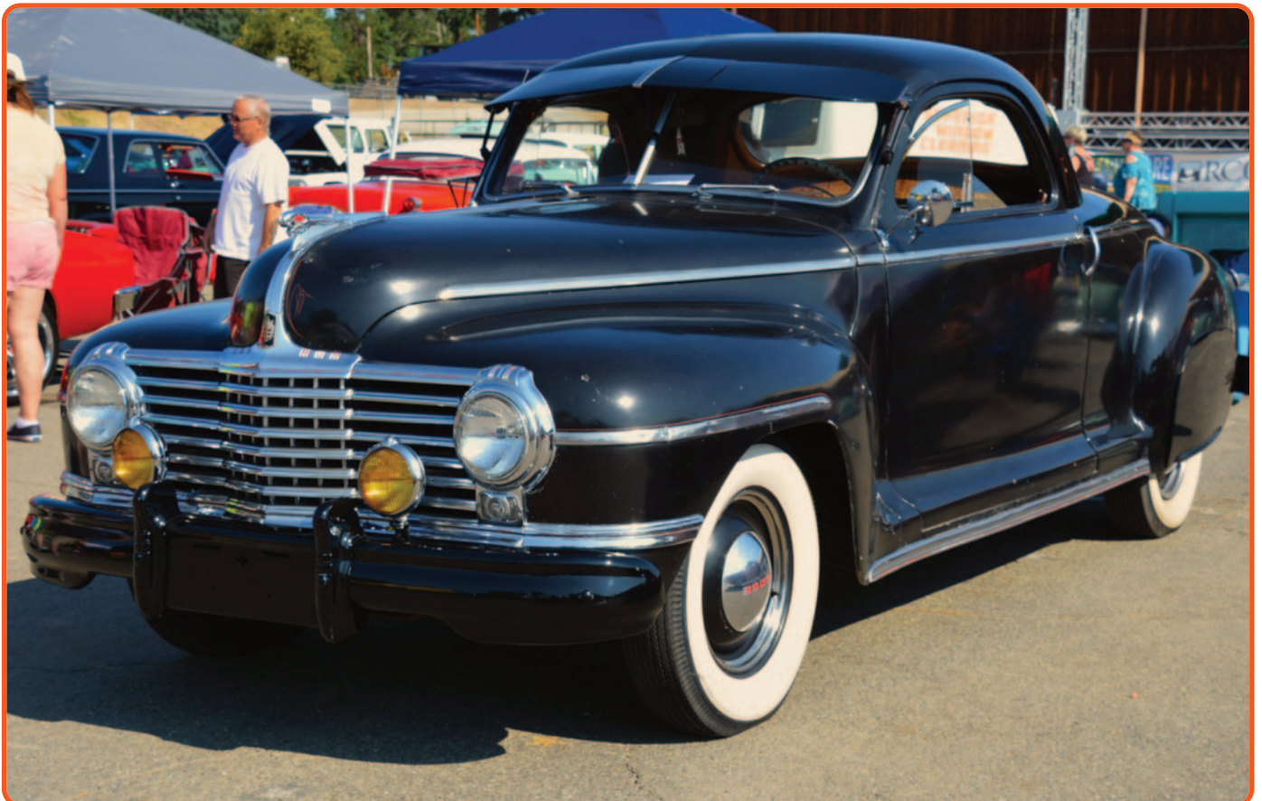
Rarer than the proverbial hen's teeth, this 1941 Dodge business coupe was the perfect example of an unrestored pre-war survivor.