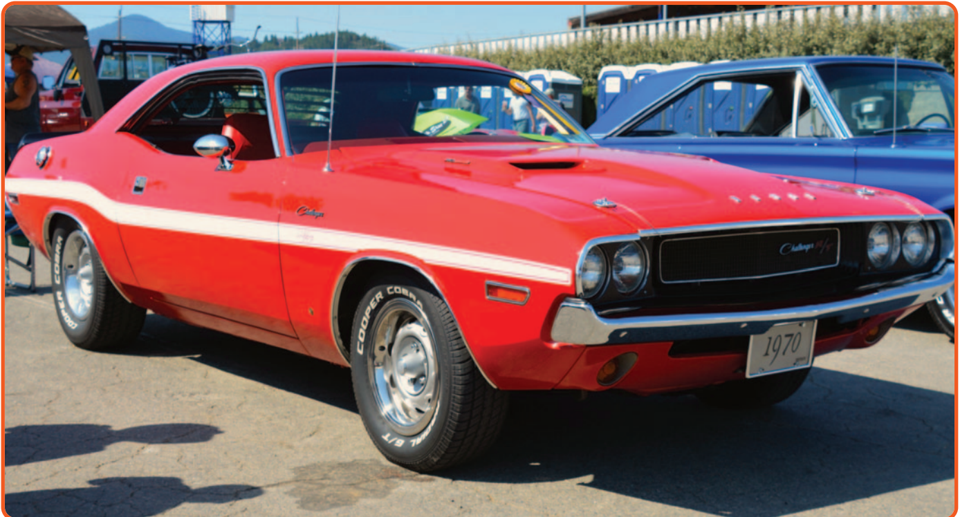
This 1970 Challenger R/T won the Mr. Norm's Award at the show. Nice, extremely original E-Body was red inside and out. It packed a stock big block and even featured a set of optional factory rear window louvers which were all the rage in 1970.