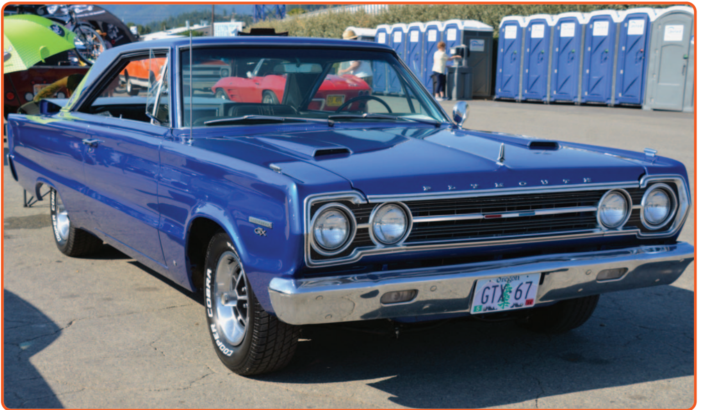
Nice original 1967 Plymouth GTX stood out in stark contrast to many of the over-the-top modified cars and trucks on display at the show. Equipped with nothing more than a set of Magnum 500s, it reminded us of what a new GTX looked like back in '67 when Plymouth was "Out to Win You Over."