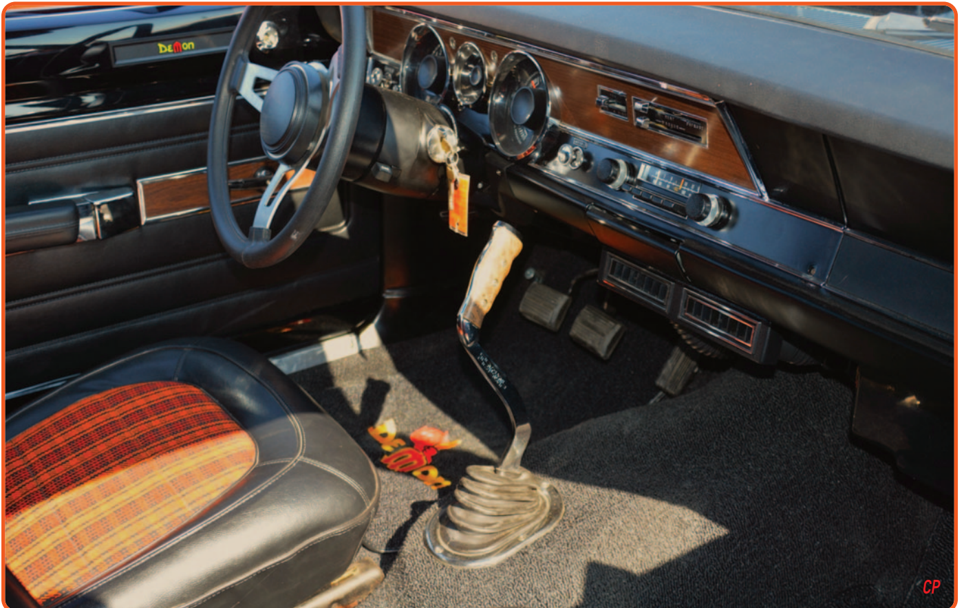
The winner of the coveted “Pick of the Park Award,” was this stunning 1971 Dodge Demon 340. It was not only straight enough for mile deep black paint but featured a myriad of performance and handling upgrades. Taking a page out of Mr. Norm’s playbook, the pro built 340 is equipped with a Six Pack induction system, while the interior features the obligatory Hurst Pistol Grip Shifter to stir the gears in the A833 4-speed and the interior even featured original plaid seat inserts. Very cool!