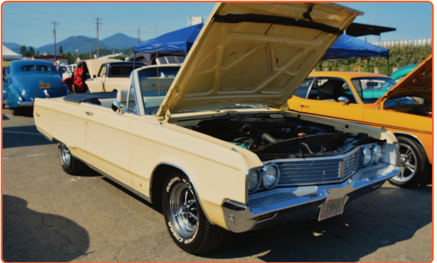
Another C-Body convertible, this one's a rare 1968 Chrysler Newport. If you think it's nothing more than the perfect ride to cruise the strand then get ready for a big surprise. Under the massive hood is a built 440 that's backed up with a beefed up 727 Torqueflite. Big and fast, the best of both worlds