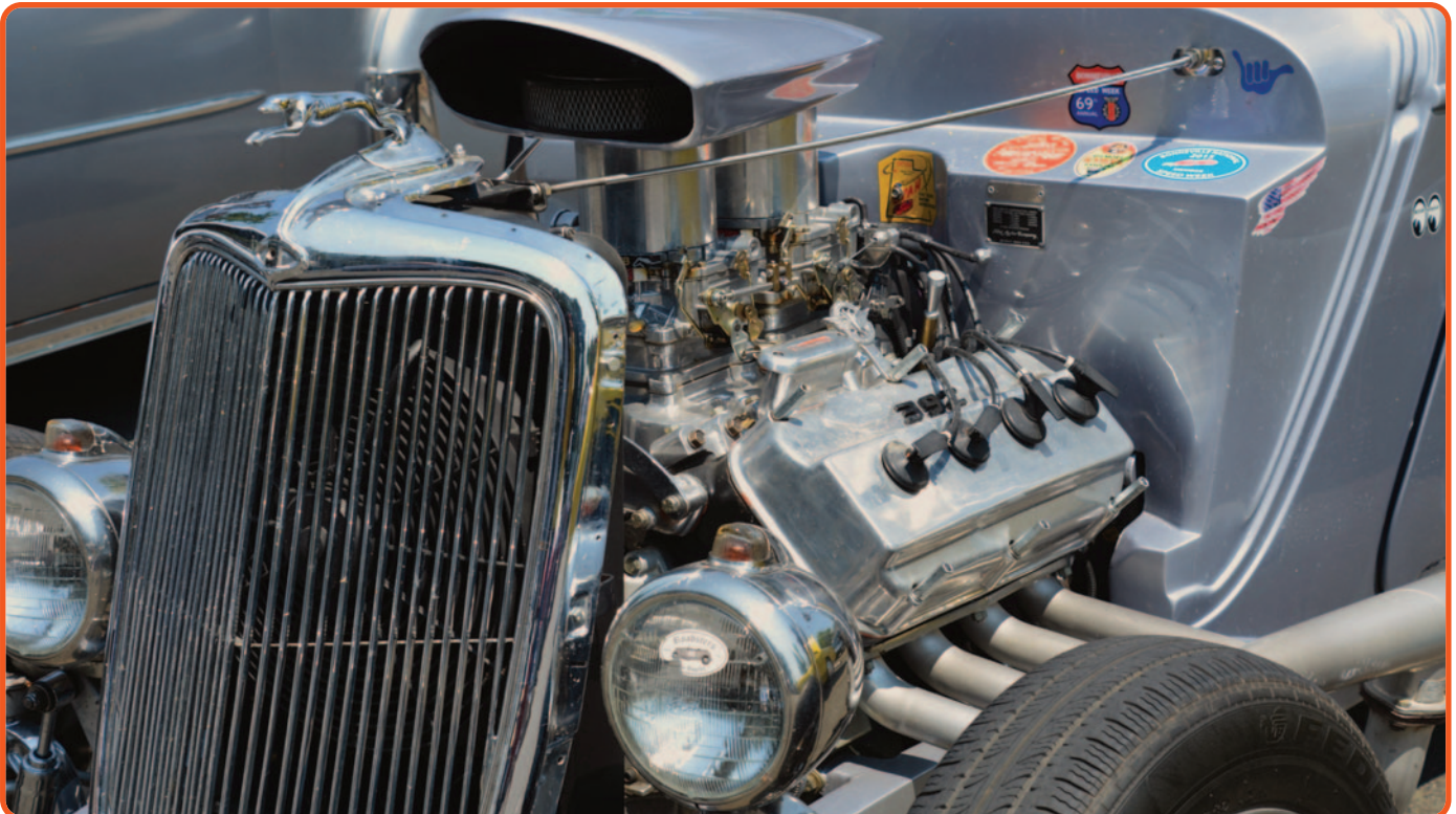
That thing got a Hemi? You bet! Badass 1934 Ford high boy street rod packed a serious punch with its pro built 1957 392 Hemi.