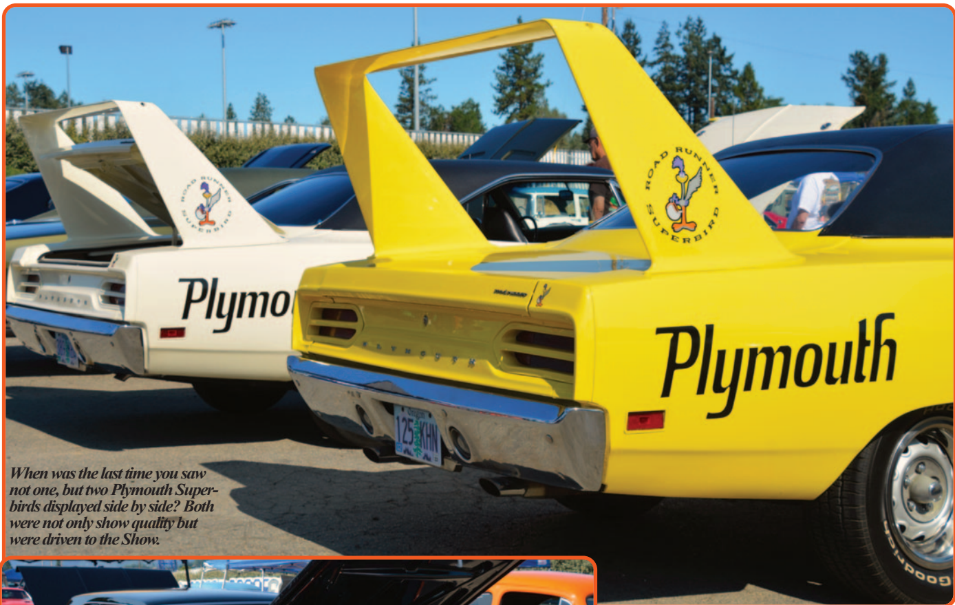
When was the last time you saw not one, but two Plymouth Superbirds displayed side by side? Both were not only show quality but were driven to the Show.