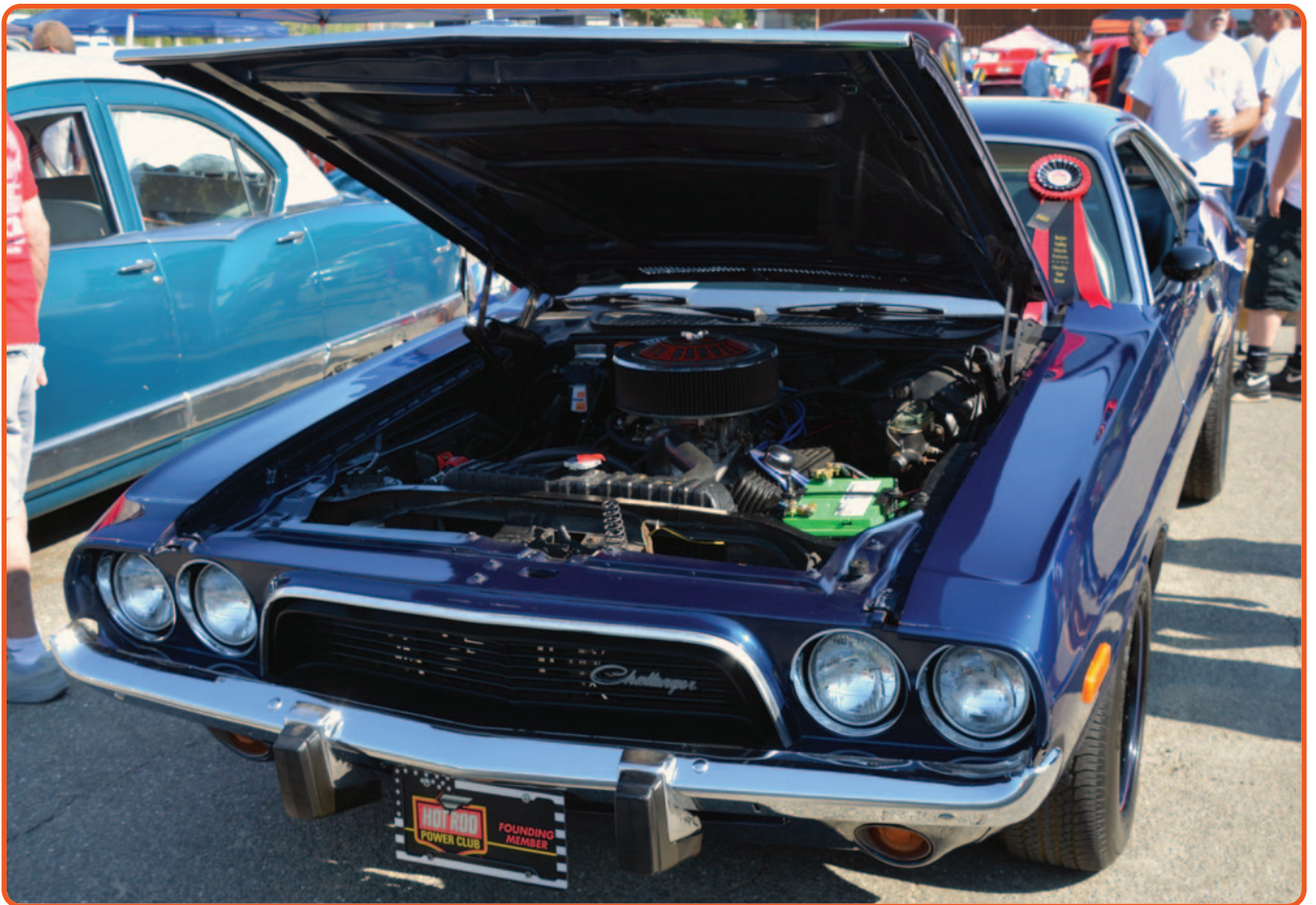
Unlike the '70 Challenger, this early E-Body was highly modified and looked like it was ready to race. Deep blue paint and rolling stock that consisted of matching painted wheels and the largest tires that would fit under the fenders, this one was all business. A 440 built to the max backed up the tough look, and dared anyone to challenge it, no pun intended.