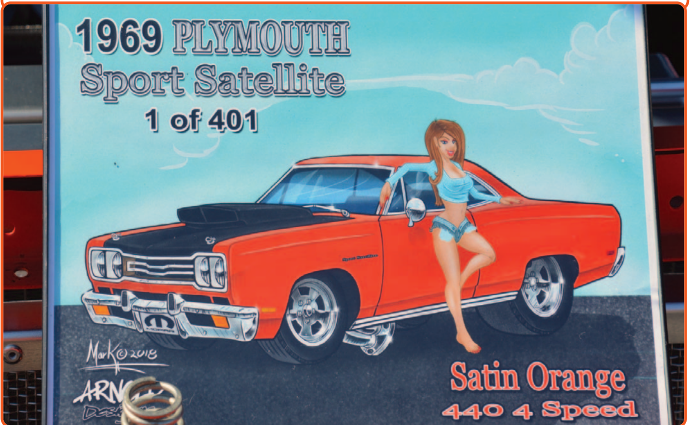
1969 Plymouth Sport Satellite dazzled under the sun in retina searing Satin Orange. Packing a 440 with plenty of performance mods, it showcased the perfect marriage of vintage and modern muscle. We particularly like the custom-made sign on the core support.