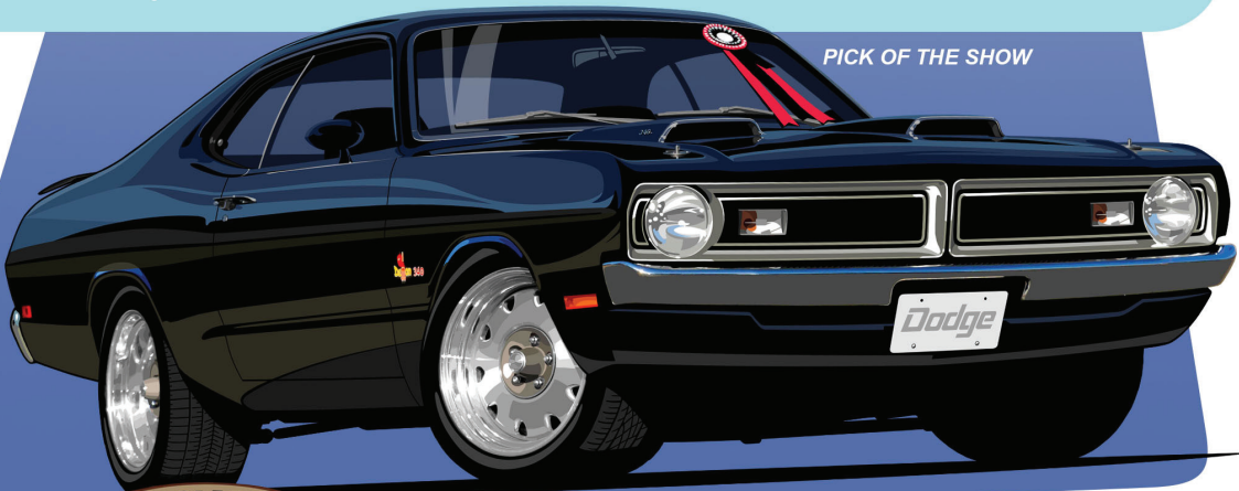
PICK OF THE SHOW